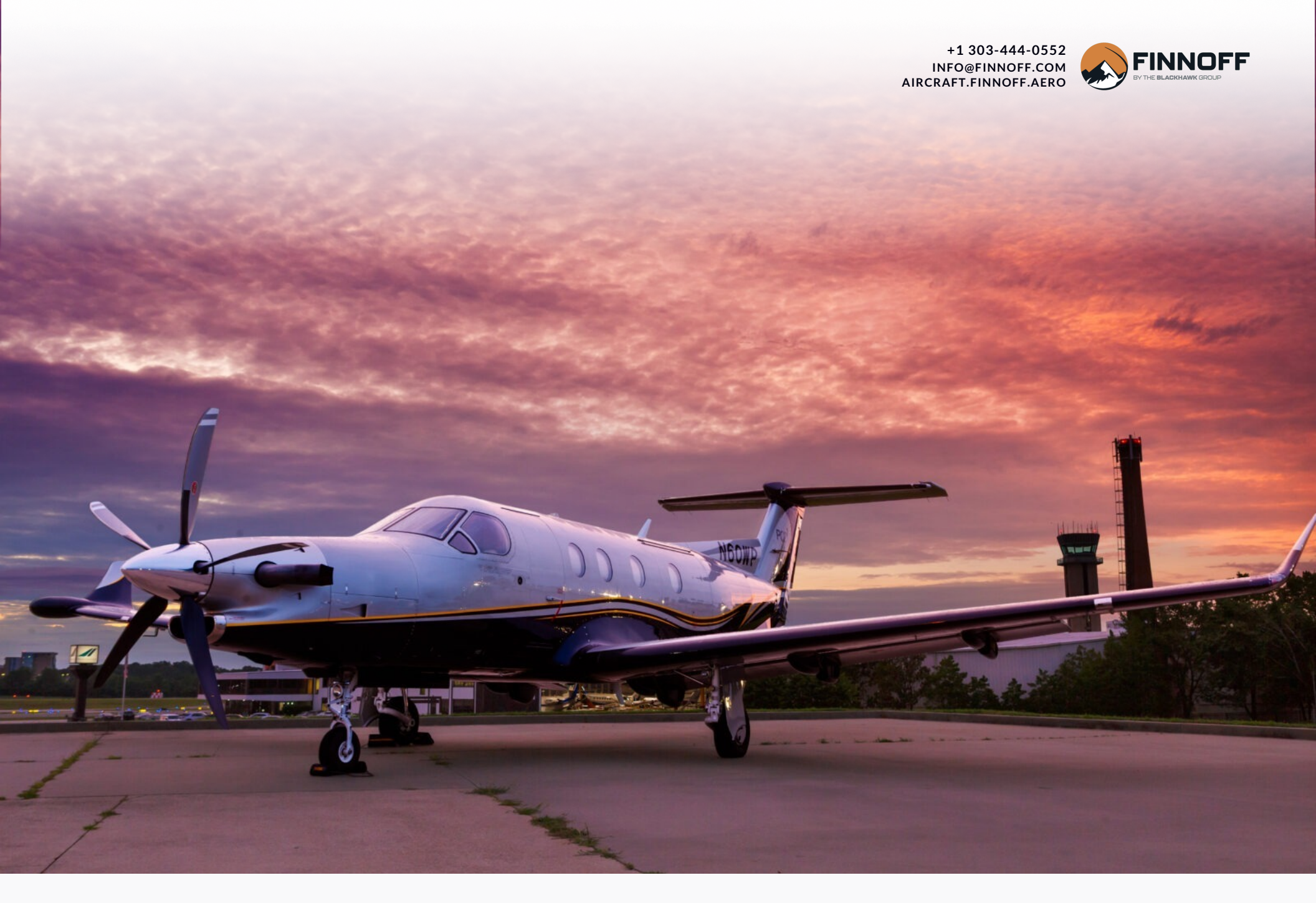
1996 PILATUS PC-12/45 S/N 144