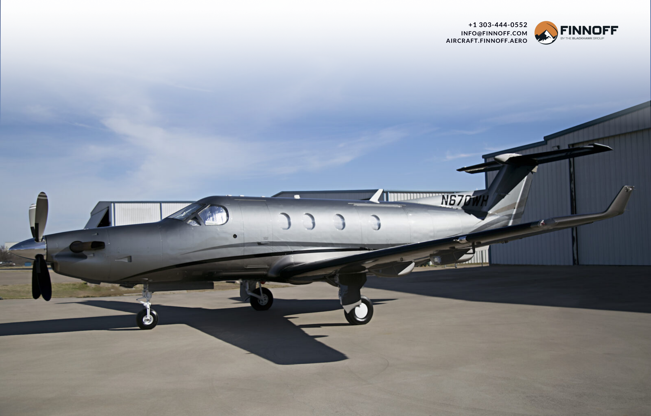
2005 PILATUS PC-12/45 S/N 670