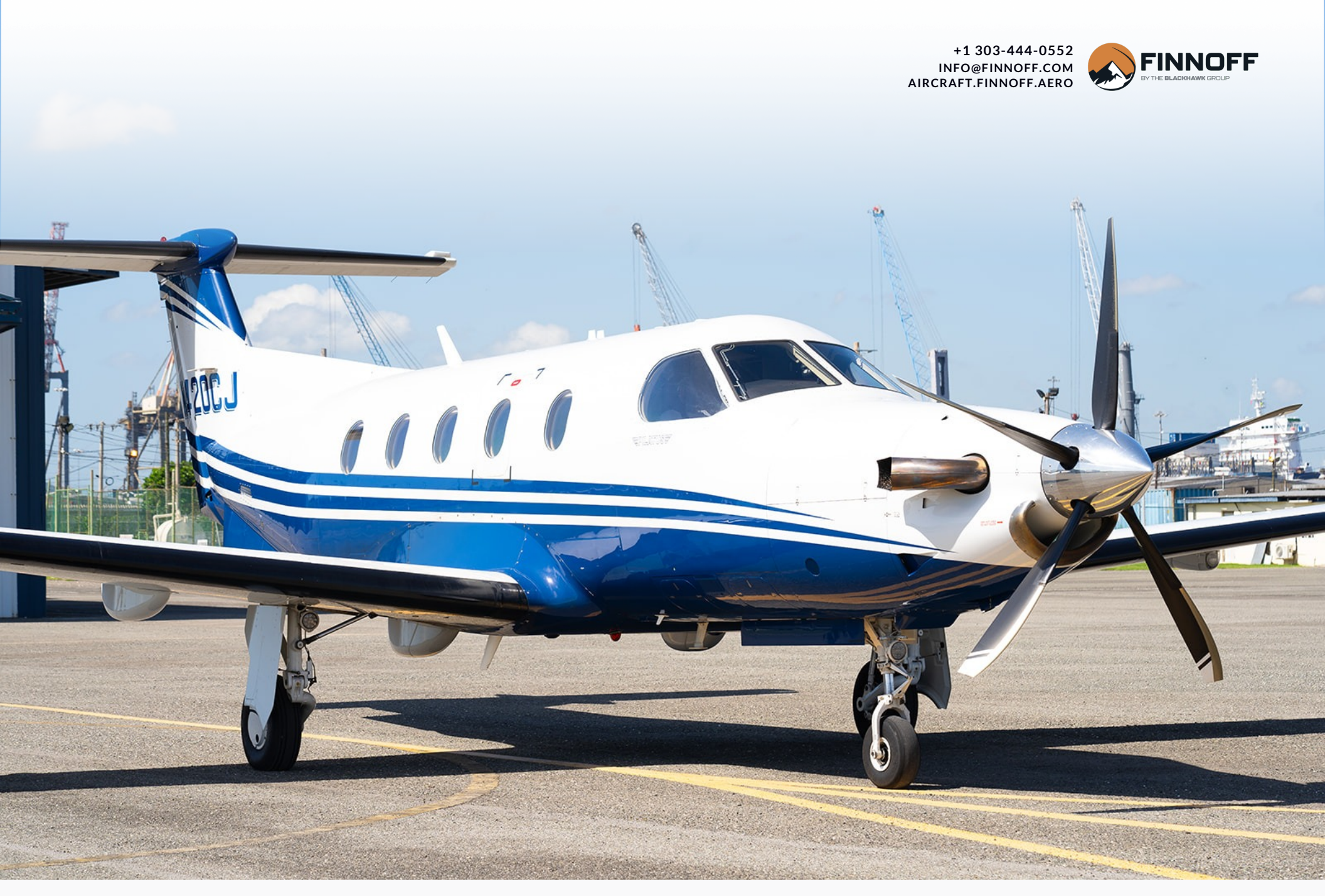
2001 PILATUS PC-12/45 S/N 420